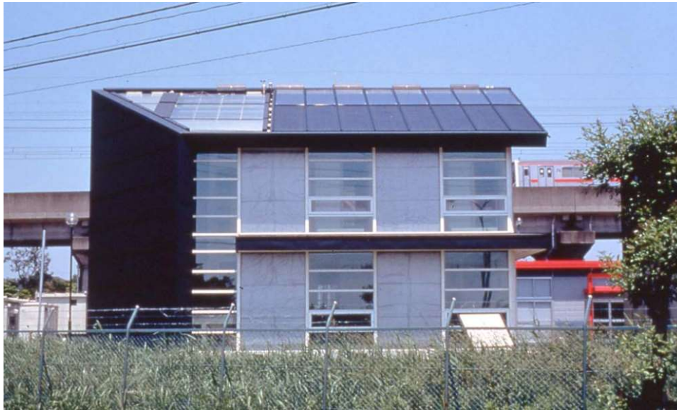
House Japan Intermediate Demonstration Building (Maihama Chiba pref.)

House Japan Project by the Ministry of International Trade and Industry (from 1994 to 2001)